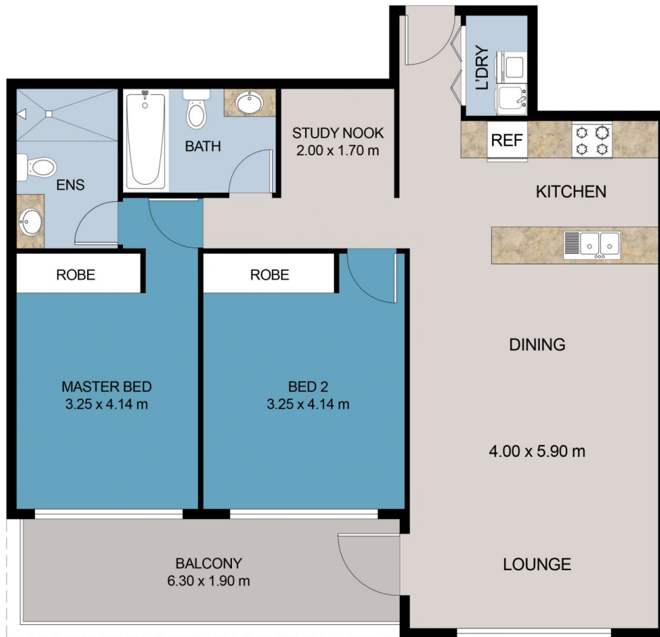
LEVEL 3 FLOORPLAN