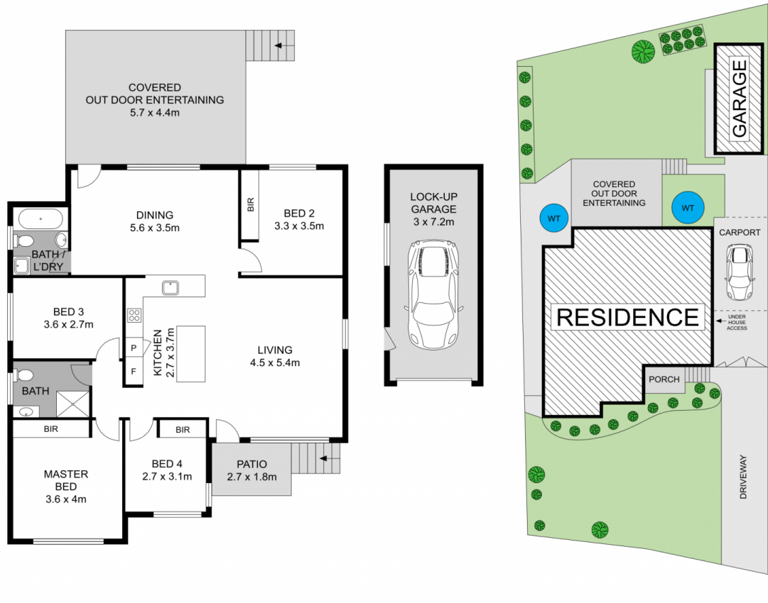
30 Nevis Crescent, Seven Hills