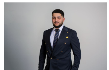
Morees Basika 0405 544 035